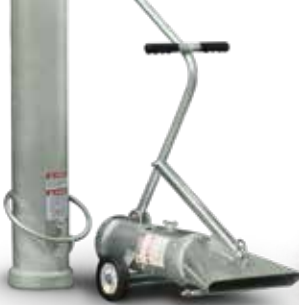
Floor Sweep Nozzle